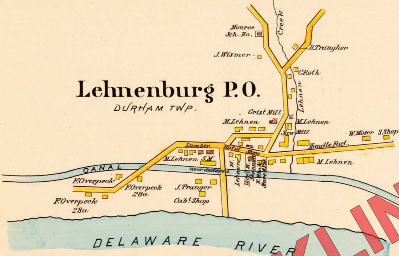
Lehenburg P.O. DURHAM TWP.